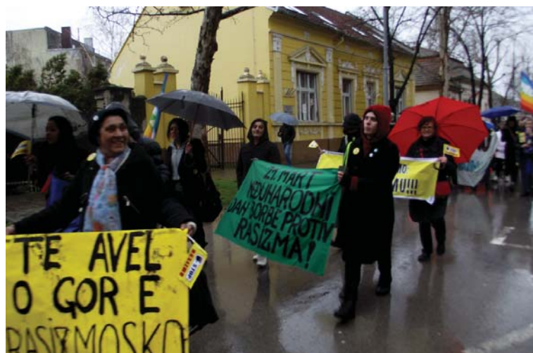
Women’s anti-racism march on the occasion of the International Day against racism, a week of European action against racism and during the month of Roma Women’s Activism, March 21 st , Novi Becej